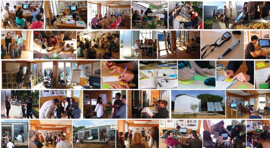
Fig. 2: Diversity of uses of Living Lab LOW3 for research, teaching and university outreach

Figure 2 shows the diversity of uses of Living Lab LOW3 for research, teaching and outreach.