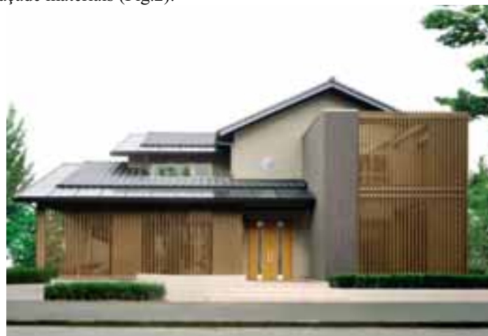
Fig. 2: ‘Wa no Nagomi’ zero energy cost house in Japan