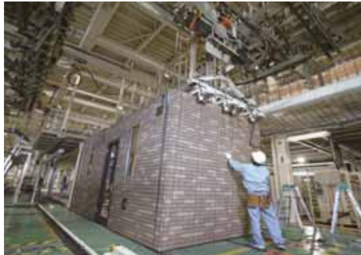
Fig. 4: Sekisui Heim production line

focuses on the production of high performance and value-added housing products where their modular construction system technologies are brought into effect. In general, modular housing systems ensure a high level of in-factory completeness of housing components. The company claims that nearly 80% of housing components used for building a house can be assembled at their factory. Today, Sekisui Heim possesses 8 factories nationwide which have the capacity for producing wood- and/or steel-frame modular homes through their highly mechanised assembly lines (Fig.4). Moreover, given the cumulative sales of over 85,000 solar homes to date, the company is also recognised widely as the largest modular manufacturer of net zero-utility-cost housing in Japan.