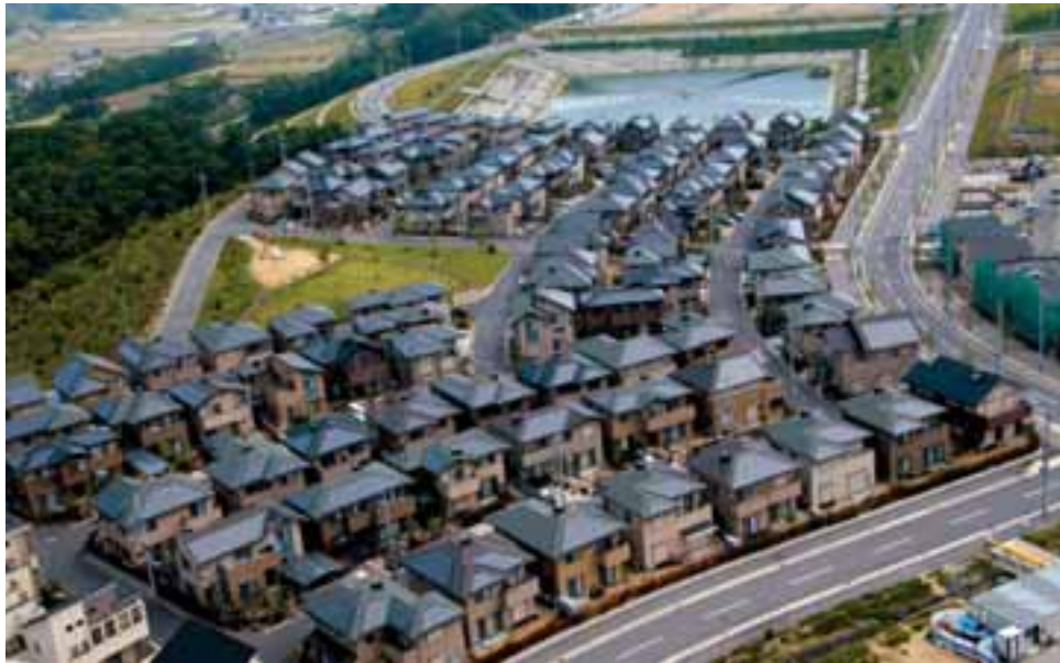
Fig. 6: PanaHome City Seishin Minami housing estate in Hyogo Prefecture

dates back to the introduction of its first house prototype called ‘Matsushita Type-One Housing Units’ in 1961. Then, the Koto Plant (present Head Plant) also opened in Shiga Prefecture. Today, PanaHome produces steel-frame panels applied to their industrialised mass custom homes through highly automated production lines. In line with their state-of-the-art automation system, the company has also been at the forefront of solar community developments. In fact, the PanaHome City Seishin Minami housing estate in Hyogo Prefecture was selected as one of 100 excellent regional projects that introduced new types of energy hosted by the Ministry of Economy, Trade and Industry, and the New Energy and Industrial Technology Development Organization (Fig.6). Afterwards, their proposal was also adopted in a scheme, which was led by the Ministry of Land, Infrastructure, Transport and Tourism, and entitled ‘Initiative Model Project for Developing Long-Life Houses.’