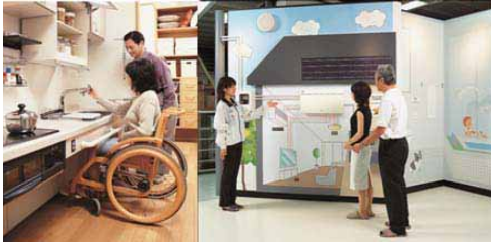
Fig. 7: 'Nattoku Kobo' home amenities experience studio

free design, home security, earthquake and typhoon resistance, energy and space use efficiency, and local power generation (Fig.7).