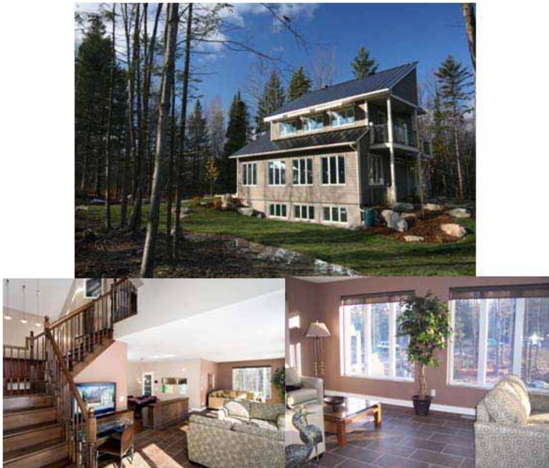
Fig. 8: The ÉcoTerra house by Alouette Homes

In 2006, Alouette Homes entered the house in the ‘Equilibrium’ sustainable housing competition that had been run by the Canada and Mortgage and Housing Corporation (CMHC). On 13 th February, 2007, the Canadian government unveiled the finalists of the competition (CMHC, 2007). In total, 12 homebuilder teams were originally selected out of 72 entries and the Alouette Homes’ ÉcoTerra house was also included in the list of the winning projects. On 9 th November, 2007, the grand opening of the ÉcoTerra house was held at the construction site in Eastman, Quebec, where the Honorable Christian Paradis, who was the then