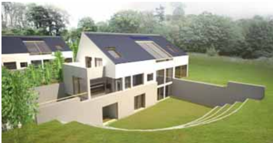
Fig. 9: The Z-en house, ROBERTRYAN Homes