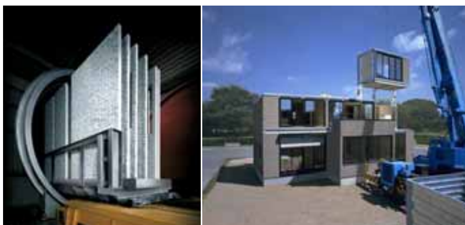
Fig. 5: Precast autoclaved lightweight concrete panels

Misawa Homes Co. Ltd.: Founded in 1967, the company is headquartered in Tokyo, Japan. Misawa Homes, together with its subsidiaries, engages in the development, construction, and marketing of prefabricated mass custom homes and housing materials. Their house is also constructed based on 3-dimensional modules consisting of rigid steel frames. Yet, their homes are characterised by the use of large-sized non-structural ‘precast autoclaved lightweight concrete’ (PALC) panels that the company produces (Fig.5). Misawa Homes started business operations upon acquisition of the housing industry’s first certification from the then Ministry of Construction in 1962. The company spread a ‘Home Core’ design concept by building the demonstration homes in Abu Dhabi, UAE in 1968. Afterwards, Misawa Homes put 1-million JPY Home Core houses on the local market in 1969 and the concept was well exhibited at Expo ‘70 in Osaka. In 1980, the company commenced with research on the development of its own zero-energy housing prototype and in 1998, it successfully commercialised Japan’s first zero energy homes.