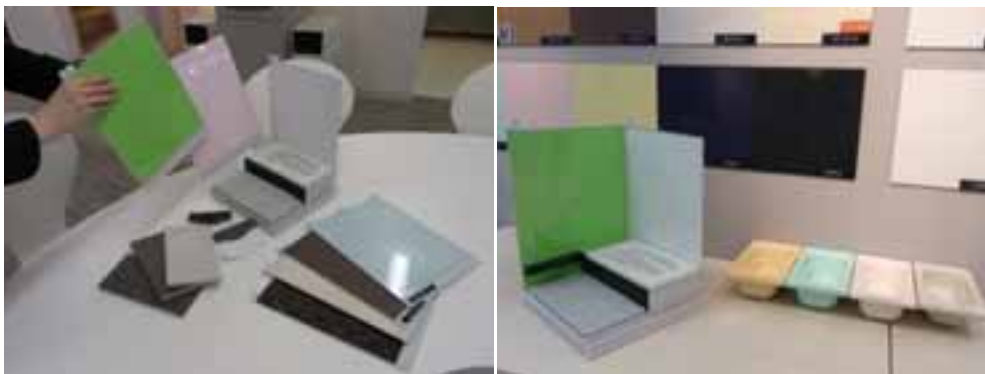
Fig. 3: Miniature bathroom unit model for ceramic wall tile and bathtub selections

INAX Corp.: Since 1924, INAX has pioneered a number of industry innovations including the first Japanese shower toilet and the world's first self-powered, automatic water faucet. The company is based in Tokyo, Japan, employing 15,861 workers (as of March 31, 2009). INAX manufactures and supplies building materials, tiling and sanitary fixtures applied for residential, commercial and public buildings and facilities. The company is considered as a practitioner of 'mass customisation' when designing their modularised bathroom unit in compliance with customers' choices of the standard decorative and functional components given. Miniature bathroom models accompanied by a set of the options are utilised to mass-customise the unit with the aim to accommodate the user demands, requirements and expectations (Fig.3). Most clients visit their showroom a few times to understand the value of product quality and decide a particular bathroom style available for their further design arrangements. However, once the style is determined, the bathroom unit design can be completed within 2 hours using the relevant mass-customisable miniature model.