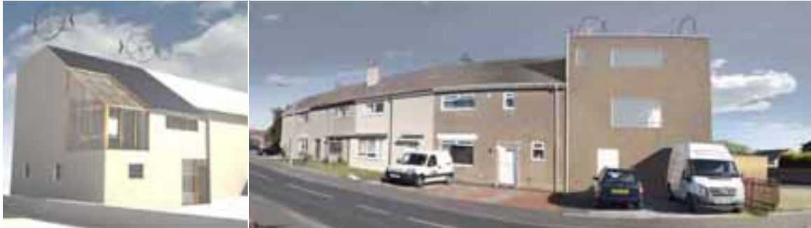
Fig. 10: ZEMCH Prestwick, NRGStyle